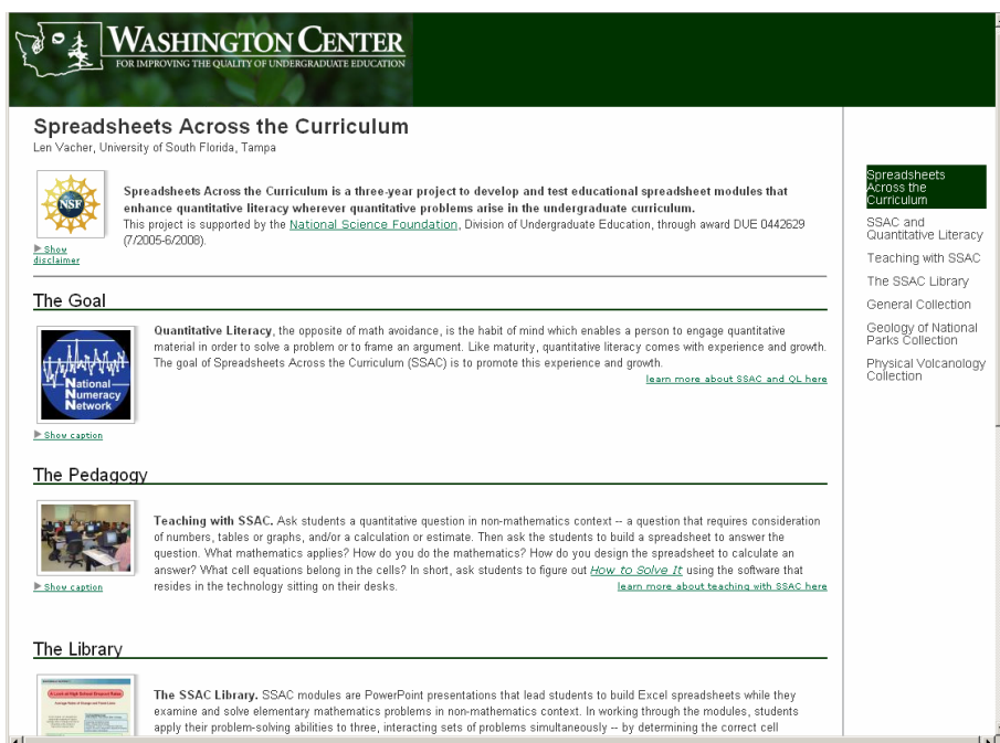
Figure 4. Screen shot of home page.

page has six links. “SSAC and Quantitative Literacy” expands on the goal of the project. “Teaching with SSAC” is a group of pages that brings SSAC into the shared design of other pedagogies in the Pedagogical Services project portal. “The SSAC Library” describes the design of the modules, the code numbers, and the cover Web pages (described below) that introduce the individual modules.